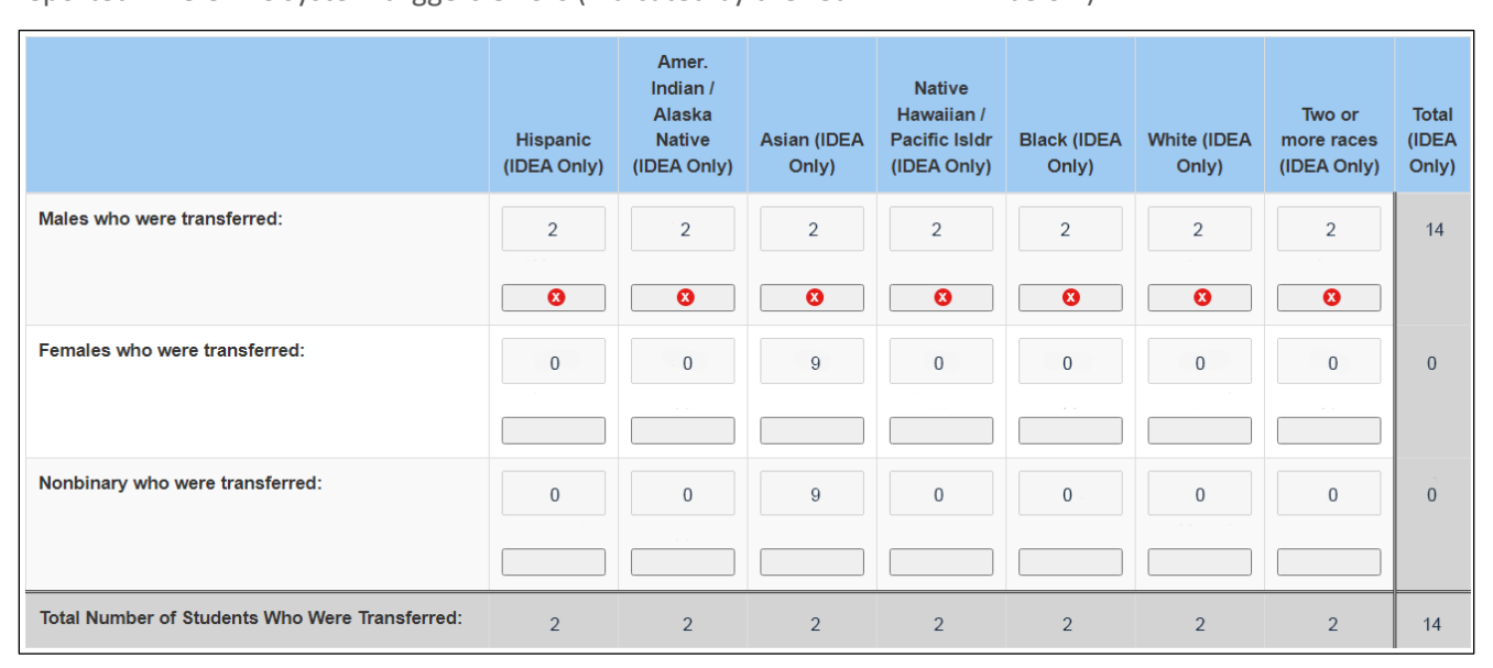
Figure 3 DISC-15b: Discipline of Students with Disabilities – Transfer to Alternative School table.

However, in DISC-14: Transfer to Alternative School for Students without Disabilities , there are 14 students reported. The CRDC system triggers errors (indicated by the red below).